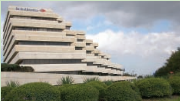
Water Repellent: The Pyramid Building, San Antonio, Texas

By applying Professional® Water Sealant & Anti-Graffitiant prior to vandalism, it establishes a long-lasting barrier which prevents paint penetration. This allows for repeated cycles of graffiti removal when Professional Phase II Cleaner is used.