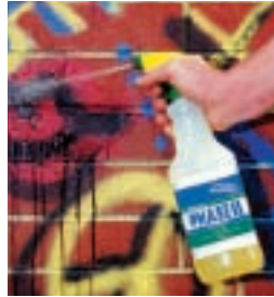
Spray tagged surface with Phase II Cleaner.