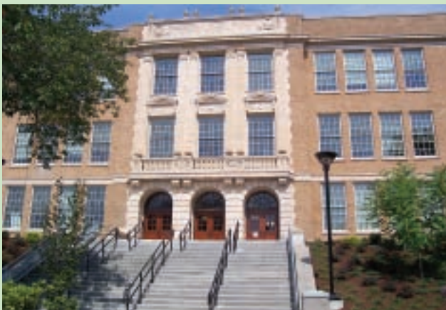
Graffiti Protection: Roosevelt High School, Seattle, Washington (Historic Register)