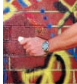
Agitate with brush, if necessary.