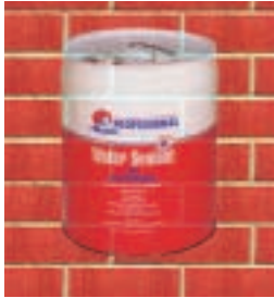
Pretreat surface with Professional® Water Sealant & Anti-Graffitiant.